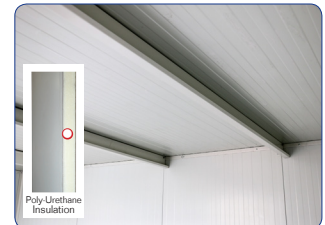
Building Reinforced with Metal Columns and Beams. ○ Panel Walls are Fire-retardant CFC Free Poly-Urethane Insulation.