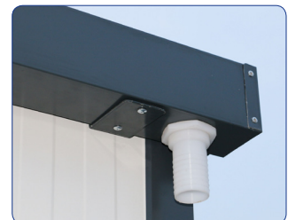
Rear Roof Rain Gutter System