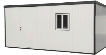
With One Right Extension Kit Added