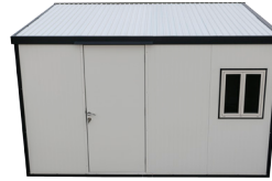
Roof Top View